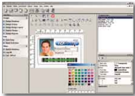
Image shows the IDPro7 card design feature

IDPro allows multiple card types to be produced from the one installation