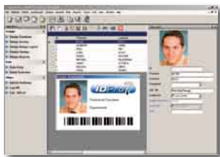
Image shows the IDPro7 batch selection feature

At Payne Security our experience with IDPro and the requirements of the commercial sector mean we understand what you need and will work with you to design, create and support an ID card system relevant for your business or organisation.