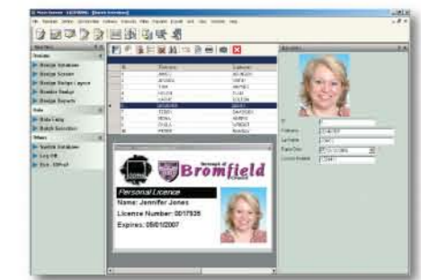
Image shows the IDPro7 batch selection feature

At Payne Security our experience with IDPro and the requirements of the public sector mean we understand what you need and will work with you to design, create and support an ID card system relevant for your organisation.